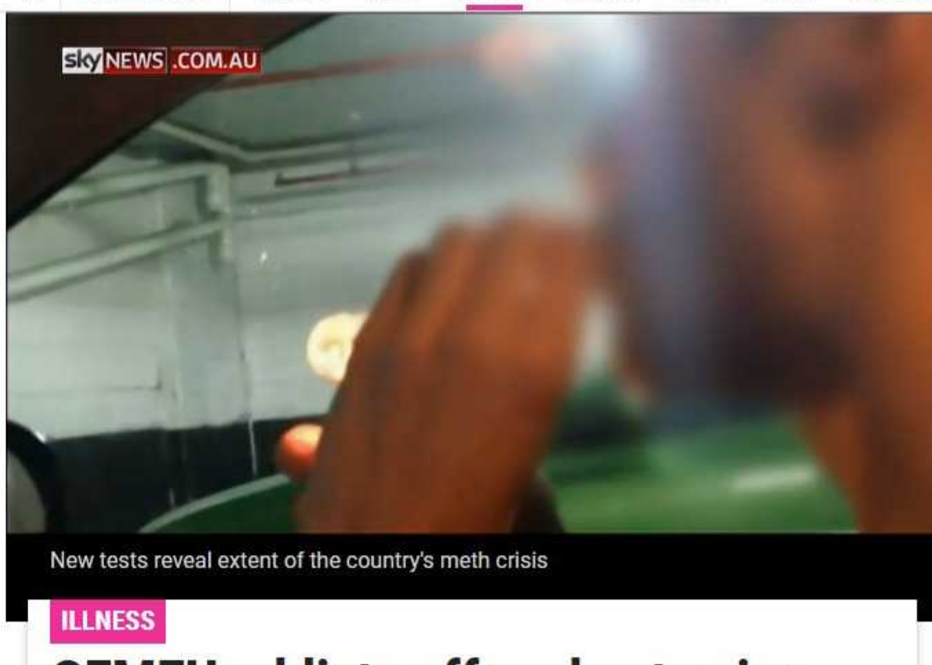
New tests reveal extent of the country's meth crisis