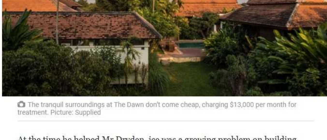
The tranquil surroundings at The Dawn don't come cheap, charging $13,000 per month for treatment.