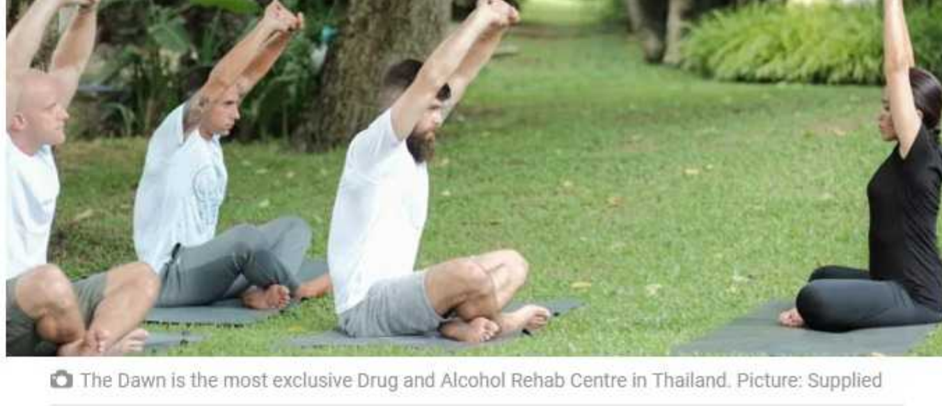
The Dawn is the most exclusive Drug and Alcohol Rehab Centre in Thailand.