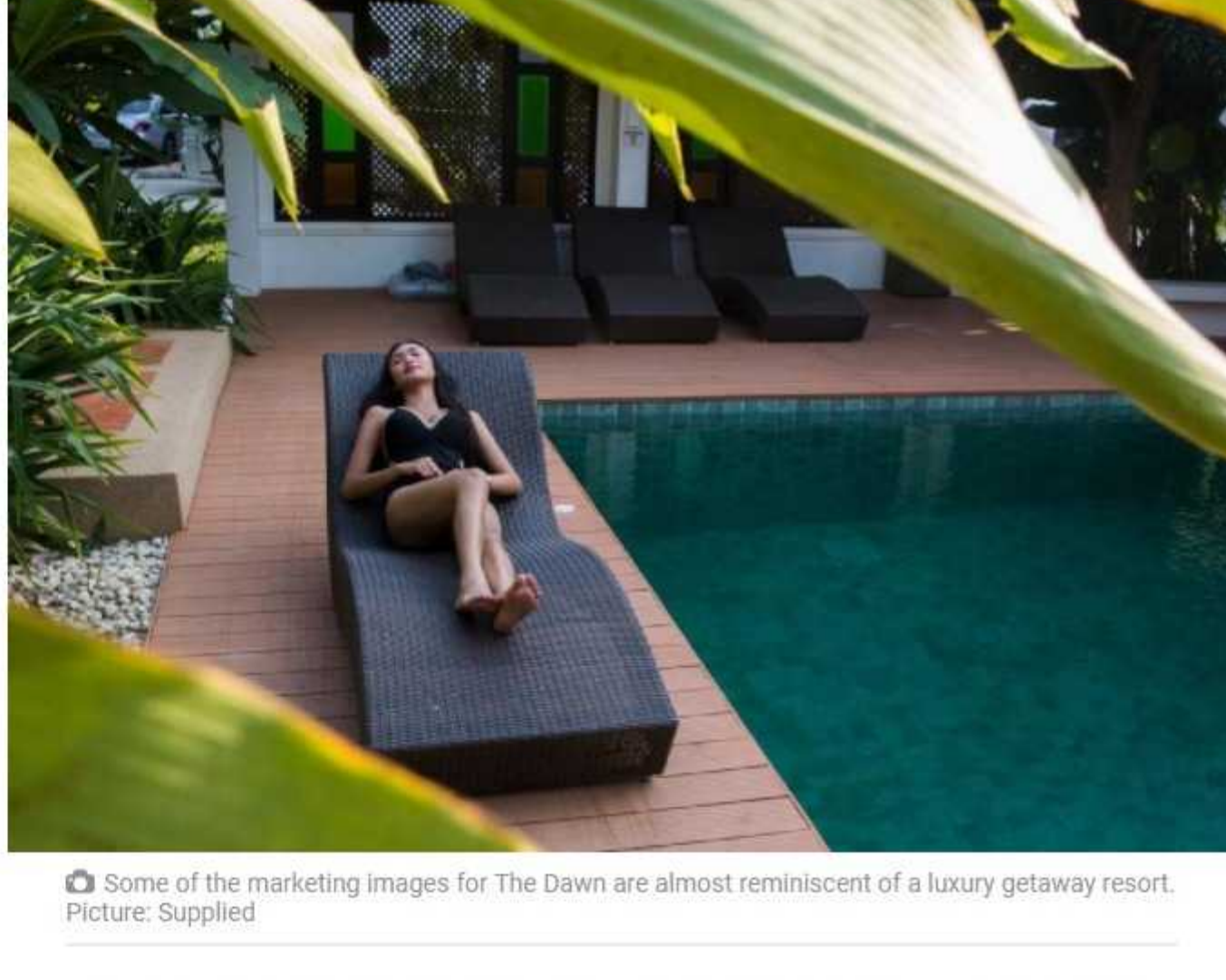
Some of the marketing images for The Dawn are almost reminiscent of a luxury getaway resort.