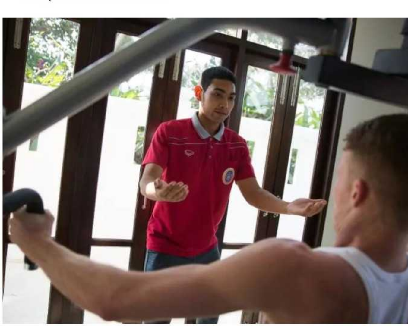
The Dawn offers a resort-style pool, games room, laundry and maid service, kingsize beds, alfresco dining area, health spa, sauna, outdoor patio with river views, Wi-Fi and a fitness area.