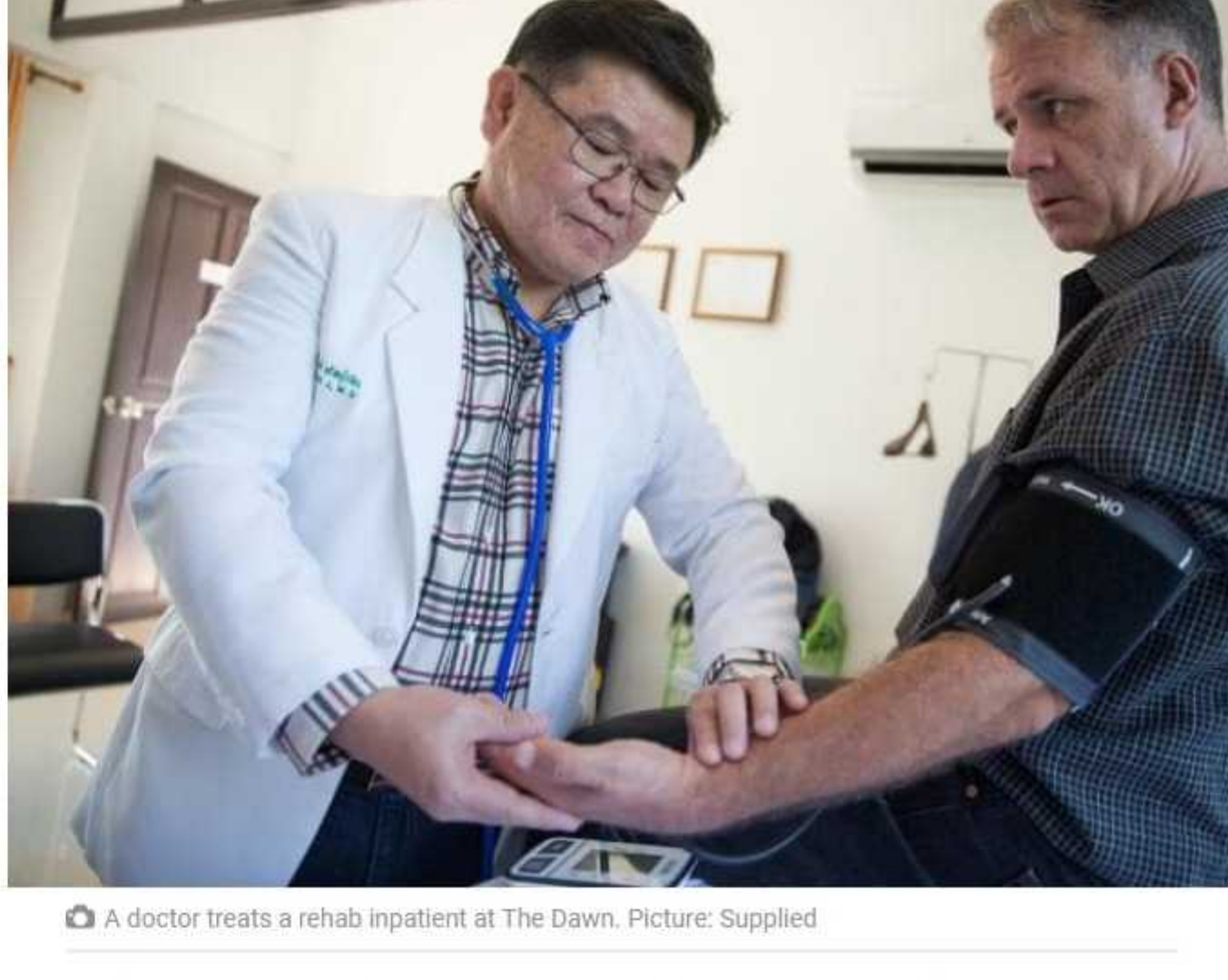
A doctor treats a rehab inpatient at The Dawn.

They reveal eight workers out of the 4870 randomly tested on Victorian worksites over the last two years had opiates in their alcohol, five had amphetamines or methamphetamines, seven had alcohol and one had cocaine.